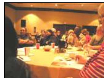
Our activists are educated

It was then on to the Hill for the most important part of the week – a coordinated assault onto the halls of Congress. NVAC