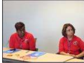
Contract Negotiations San Antonio, TX

Discussed was Article 22, "Merit Promotion". VA wanted to roll this article over "as is" and add "USA Staffing" (electronic process to apply for VA jobs on-line) to this