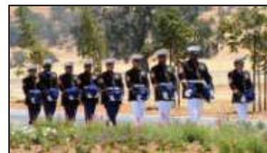
First burials at Bakersfield National Cemetery

The VA is in the final stages of implementing the largest expansion of national cemeteries since the Civil War with five cemeteries that opening in 2009 and one in 2010. These include Fort Jackson, SC; Jacksonville and Sarasota, FL; Alabama National Cemetery serving Birmingham; and Bakersfield and the National Cemetery in California Central Valley. The Washington