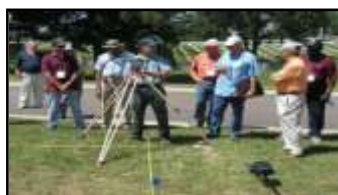
National Training Center

Interns. The focus has now shifted to encompass all other key positions within the NCA operational model which include Supervisors, Field Foreman, Program Assistants, Cemetery Representatives, Groundskeepers, Budget Analyst, COTRs, Equipment Operators, and Gardeners.